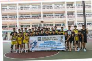
Our boys in Muar, Malaysia, at our annual overseas exchange programme with Chung Hwa High School.