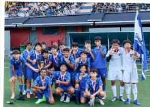
Medals out: Champions for NSG 'C' Division League 5, held at Jurong East Stadium!