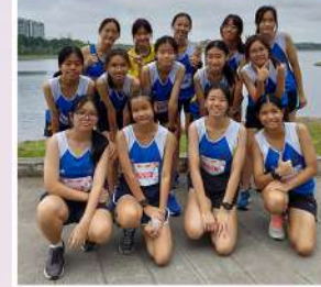
Our 'B' and 'C' division girls!