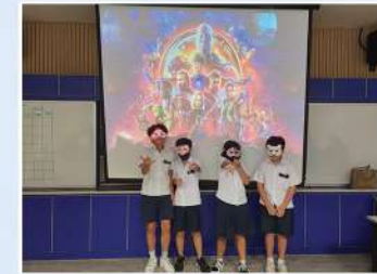
Sec 1: Trial of Heroes Inter-class competition during Humanities Week!