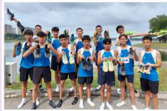
The 'B' division boys at NSG Cross Country 2023