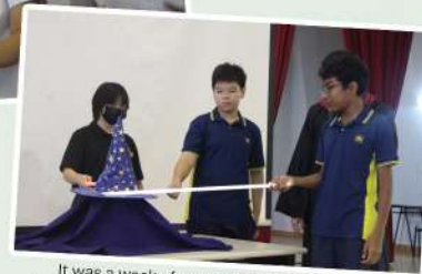
It was a week of magic as our students were impressed again and again by the powers of science!