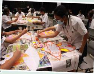
Intense focus during the Wau Batik Painting Workshop.