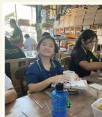
Making clay mugs at a learning journey to the Thow Kwang Pottery Jungle!