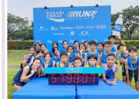
All smiles at the Pocari Sweat Run 2023