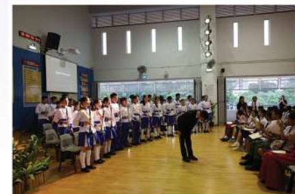
Commendation Day... a day to recognise the many talents and achievements of our students and alumni who are lifelong learners!