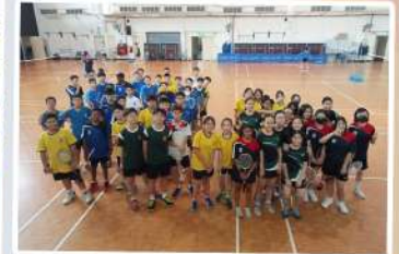
Sec 1 teams participating in the South Zone Cluster Games held at Raffles Institution