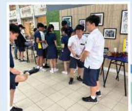
Traditional Games booths in the canteen during the various levels' recesses