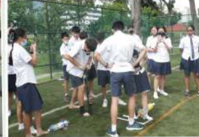
3, 2, 1... blast off! Students launch their water rockets made during the workshop!