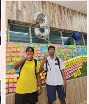
Fun facts about numbers 3, 5, & 7: Did you know that multiplying these three numbers gives you... that's right, 105 - the age of Guangyang this year!