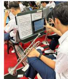
Training hard for the SYF