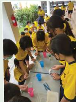
Hands-on experience during the Science Trail.