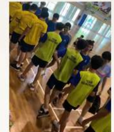
Friendly match with Deyi Secondary School!