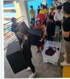
Practicing for the SYF bump-in. We attained a Certificate of Accomplishment for our efforts!