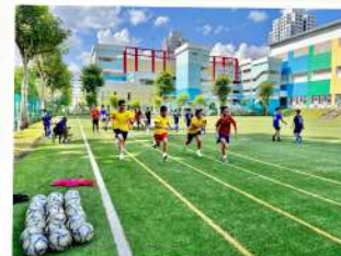
A typical warm-up session