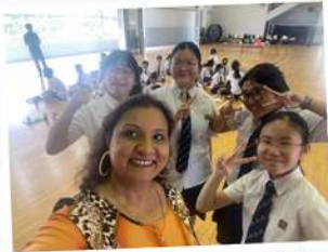
Being excellent hosts at our choir exchange programme!