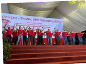
Our students singing their hearts out at the Bishan East National Day Performance!