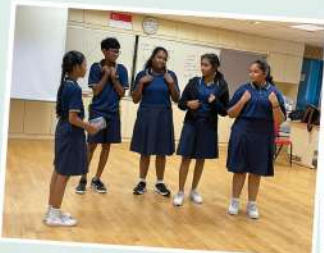
Our Tamil Language students having an animated discussion while rehearsing for a skit performance during a MTL Cultural Camp.