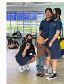
Having fun with Rod Puppetry