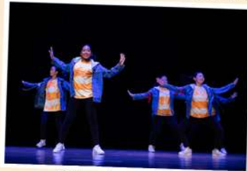
Hip Hop performance during our year-end Performing Arts concert!