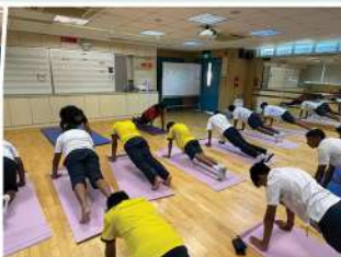
Stretching and flexing during a Yoga session!