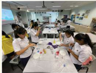
Finding the perfect blend of colours to create their very own pour painting at this workshop!