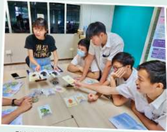
Chinese Language students participating actively in an intriguing Chinese Detective Game.