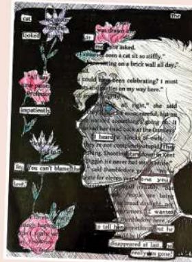
Blackout Poetry done by Andrea from 1E1.