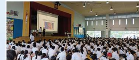
Sec 4 and 5: Taboo Gameshow during afternoon assembly