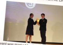
The event was marked by the passing of the signature GYSS torch, in line with our theme of A Continuing Legacy, to indicate the continuation of excellence.