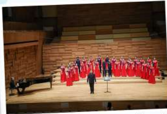
Achieving the Certificate of Accomplishment!