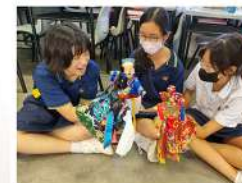
Creating stories with Traditional Hand Puppets