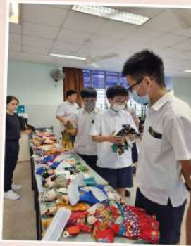
Admiring the variety of colourful puppets on display during the Puppetry Workshop during EL week this year!