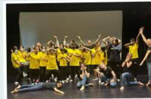
A fun drama session with theatre practitioners from Florida!