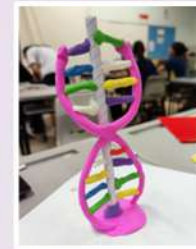
Engaged in the study of genetics, students enjoyed learning a creative approach in Sciences - using clay to sculpt DNA models!