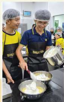
Sec 3 NFS students baking away during the SHATEC Learning Journey!