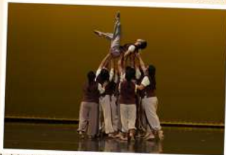
Achieving the Certificate of Accomplishment!