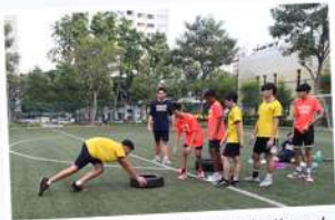
Our boys training to be physically and mentally tough at our annual basketball camp