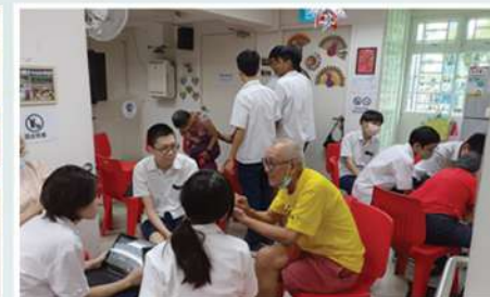
Our students also worked with different community partners, listening to the treasure trove of heartfelt life stories from the elderly, as well as delivering food hampers to the needy to usher in Chinese New Year!