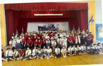
Participating in a choir exchange programme