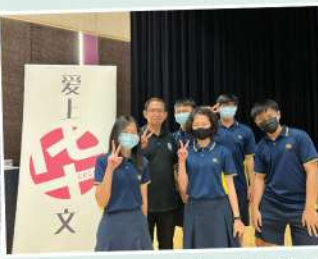
Getting a glimpse during Xinkongxia Music Camp on how to write lyrics and compose music!