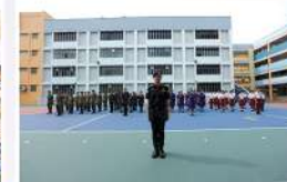
Baris...sedial! The Uniformed Groups are all ready for the Parade Inspection.