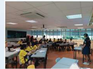
Sec 3: Ethics Debate in our Sec 3 classrooms as they take their argumentative skills to new heights!