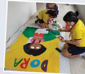
Facilitators and Sec 1s working hard on their class mascot and flags