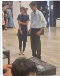
Behind the scenes of the SYF performance