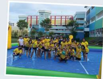
Class bonding games at the water soccer court!