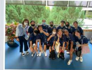
Going out for 'B' Div South Zone Inter-School Badminton Competition!