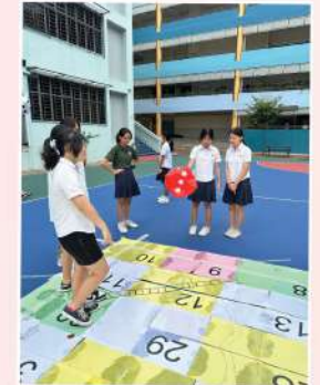
Whatever you do, don't land on a snake!