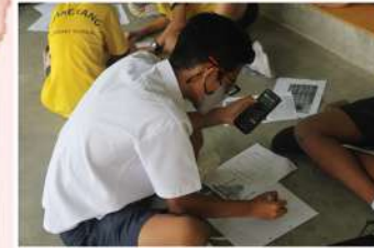
Maths in action! Puzzles waiting to be solved!