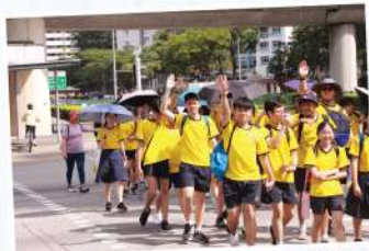
Hands up! Remember, safety comes first! And, don't forget your sunscreen!