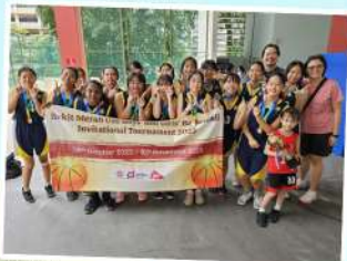
Bukit Merah invitational tournament 2023!