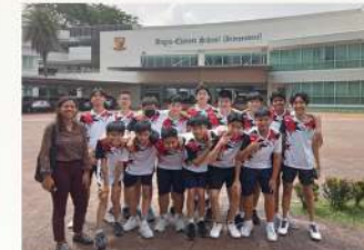
'C' Div South Zone Inter-School Badminton Competition at ACS!