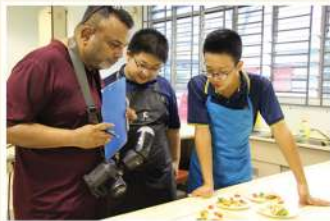
Who will win? Students eagerly waiting for the winner to be announced at this year's GYSS MasterChef Competition.