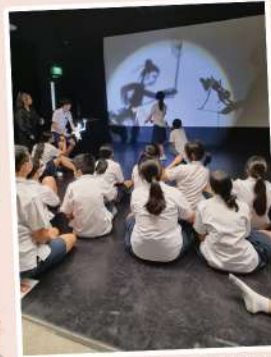
Engrossed in a performance put up by students during a Wayang Kulit Workshop!