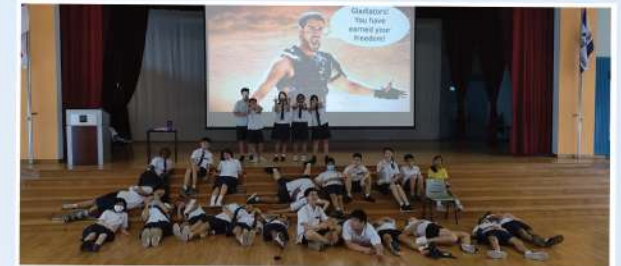
Sec 2: Gladiators - Race to Freedom! After solving many puzzles to arrive at the ending stop, our students needed a break!