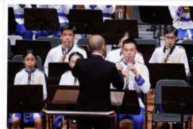
Under the guidance of our skilled conductor.