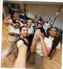
Getting ready for showtime!