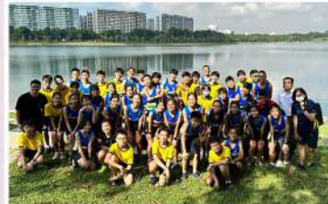
Our team at the NSG Cross Country 2023!