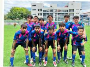
'B' Division School Team participating in the NSG