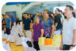
Welcome back, alumni! Singing the school song in the school hall must bring back memories!