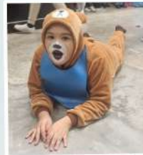
Baby Bear's verdict of SYF: It's just right!