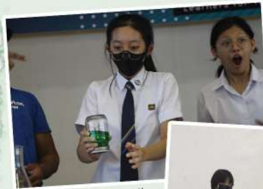
Scientifically magical! How did that happen?