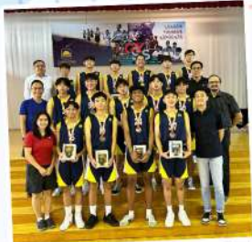
Our 'B' division boys achieved 'Top Four' in the South Zone after many hard-fought matches at this year's NSG!