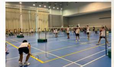
Our boys at the C Div South Zone Inter-School Badminton Competition!