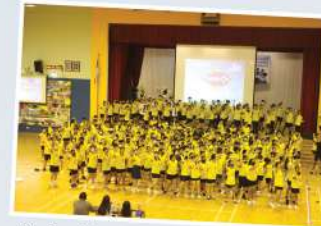
Our Sec 1 Students and facilitators coming up with a cohort dance!