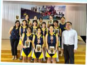
NSG 2023 - 3rd Runners up of the South Zone!