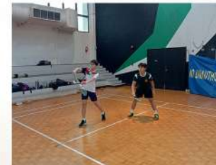
Participating in the South Zone Cluster Games held at Raffles Institution