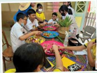
Malay Language students making Bunga Rampai during the MTL Learning Journey to Kampong Lorong Buangkok!