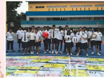
Experiencing the joy of learning through Snakes & Ladders during Math Week!