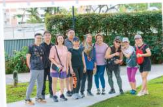
Our School Leaders and the wonderful people of our Parents Support Group making things happen!