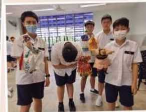
Taking a bow after their performance!