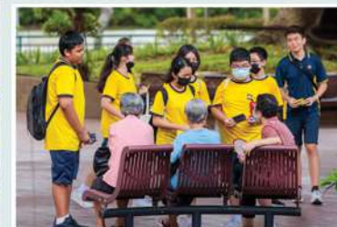
As part of our community efforts, our students spread some sunshine in the Bishan community by sorting, packing, and delivering goodies for donation!