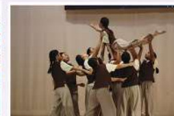
Our dancers lifting off to greater heights as they perform on stage!