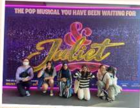
Attending the "& Juliet" musical at MBS