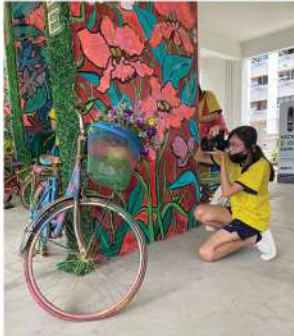
Do you see what I see? Students with a keen eye searching for interesting shots during the Bishan Art Trail!