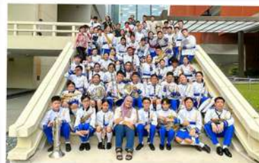
GYSS Band 2023, we did it!