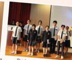
The handing over of CCA leadership positions.