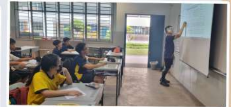
Badminton 'C' Div Boys and Girls teams learning how to umpire at a workshop held by the Badminton Coach