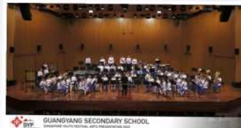
Giving our all at the SYF, where we attained a Certificate of Accomplishment!