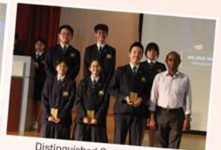
Distinguished Service award to members of the previous CMC EXCO.