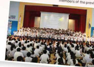
The new cohort of Student Leaders reciting the Student Leaders' pledge!