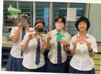
Students made coasters with 3D pens at the D&T Workshop!