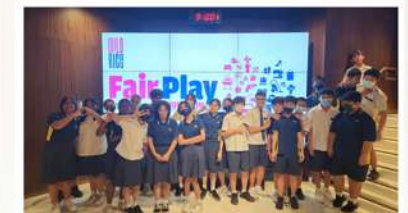
Watching 'Fair Play' by Wild Rice for our annual Guangyang Goes to the Theatre