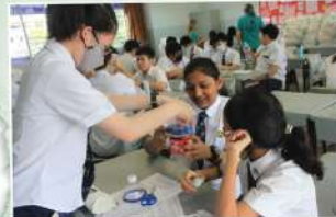
Learning how to create their water rockets.