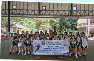
Overseas trip to Muar, Malaysia for a friendly match against Chung Hwa High School!