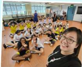
Our girls and teachers having fun at the annual basketball camp!